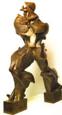
Umberto Boccioni, Unique Form of Continuity in Space , bronze, 1913.

In the early 20 th century, (especially between WWI and II) groups of artists emerged in Russia, Italy, and Germany who believed new technologies were changing artistic practice and what it meant to be an artist. In the early years of the Soviet Union, a group of artists calling themselves Constructivists theorized that under the new Socialist political system there was no longer a distinction between an artisan and the industrial class, and, as a result, a new creative figure had come to be – the artist-as-engineer. Artists such as Aleksandr Rodchenko, Vladimir Tatlin, and Varvara Stepanova advocated a rational, materialist, utilitarian approach to socially committed art, attempting to link art with industry, technology, and the ideals of a classless society through the production of socially useful objects.